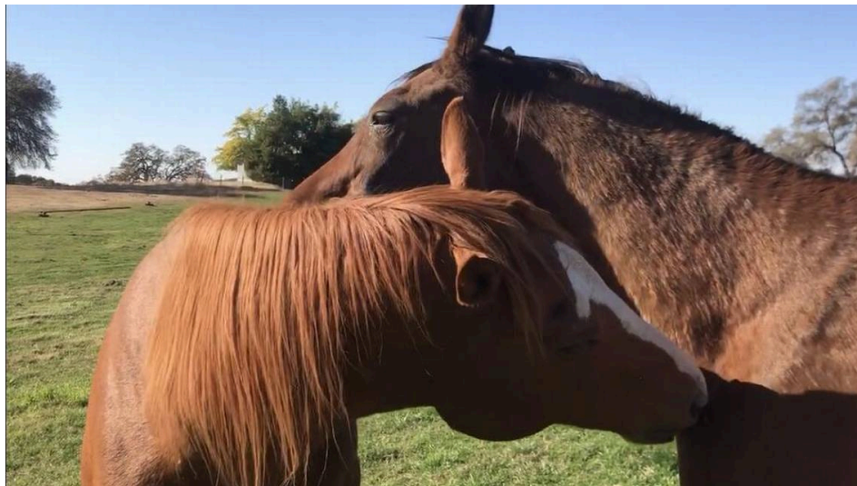
Aging horses spend time together at Horses' Honor retirement farm in Lincoln.