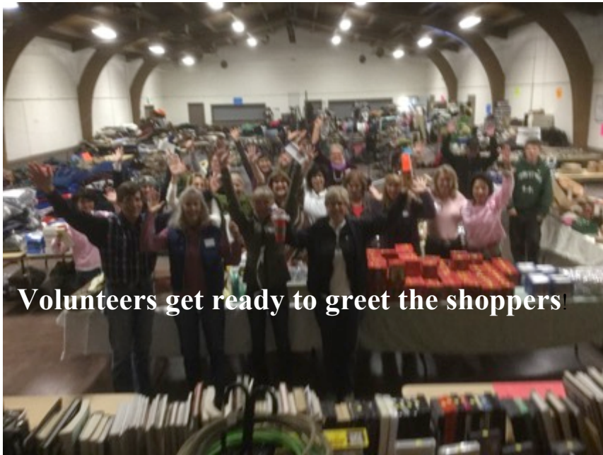
Volunteers get ready to greet the shoppers

An anonymous donor supplied a moving van & crew to transport donations from various locations to Auburn